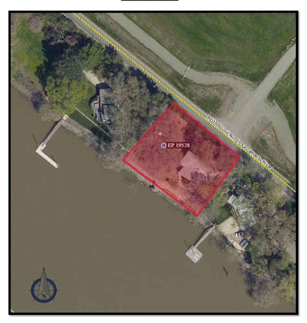
3) Proposed Footprint Map