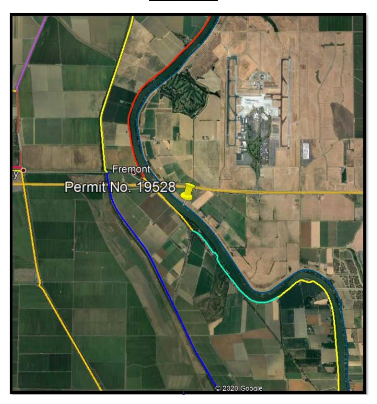
2) Project location map